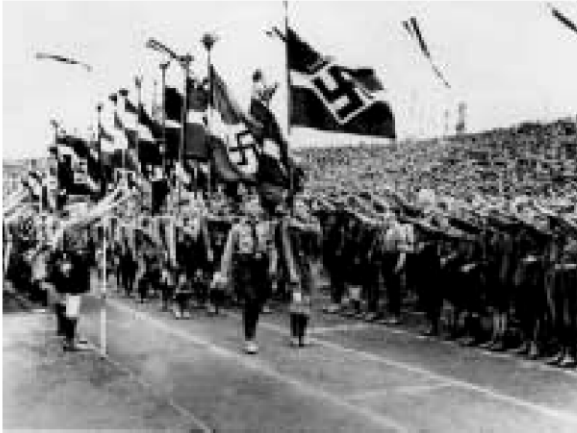
Paris, France, 1968